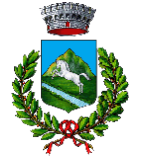
Comune di Tramutola